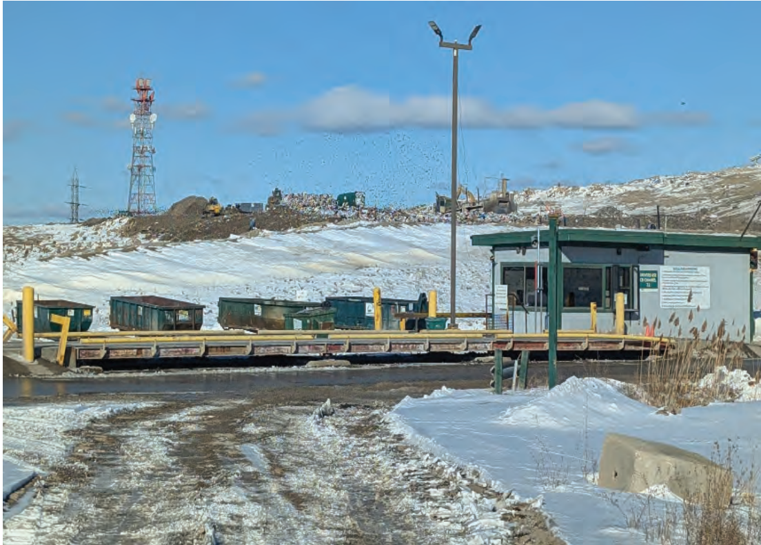
Waste placement in background of photo