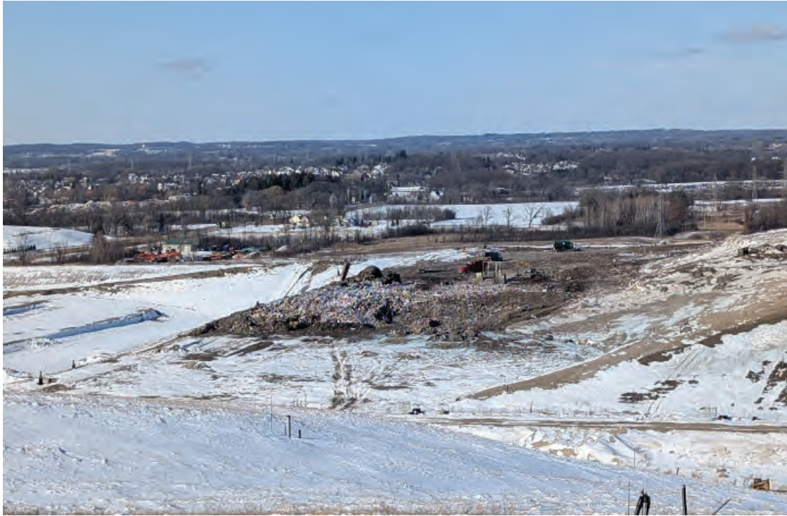
Working face at South end of Phase 3