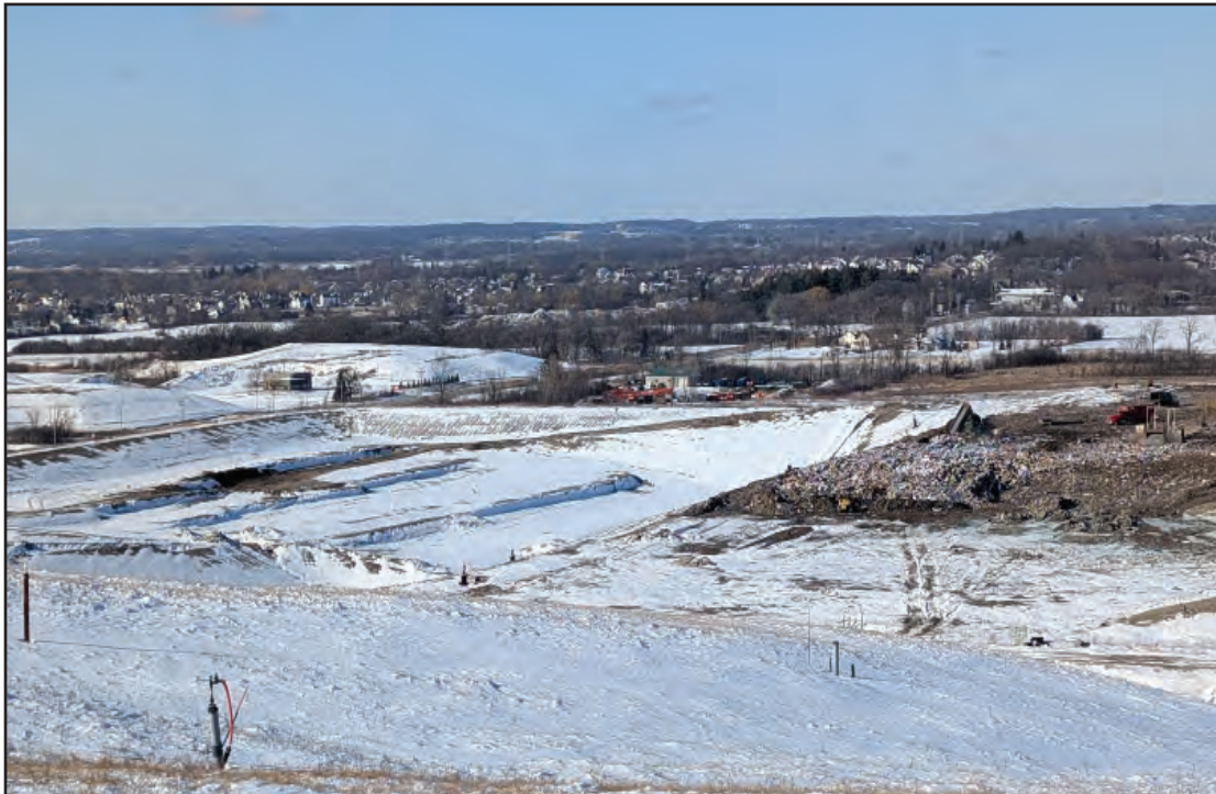
Phase 3 working face nearly at end of cell