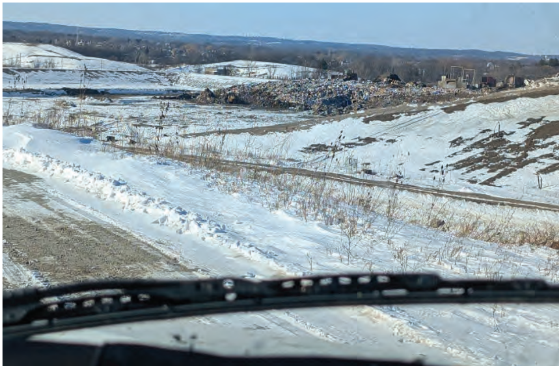
Working face at South end of Phase 3