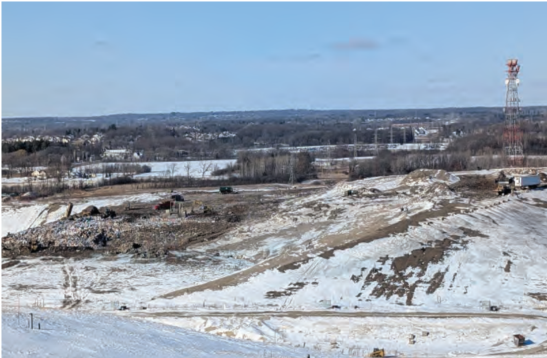
Pristine snow over Phase 1 & 2, no gas or liquid releases