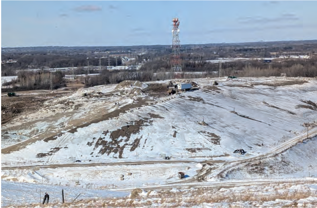
Pristine snow over Phase 1, no gas or liquid releases